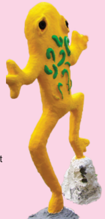
Cement sculptures at Bishan Park Secondary School